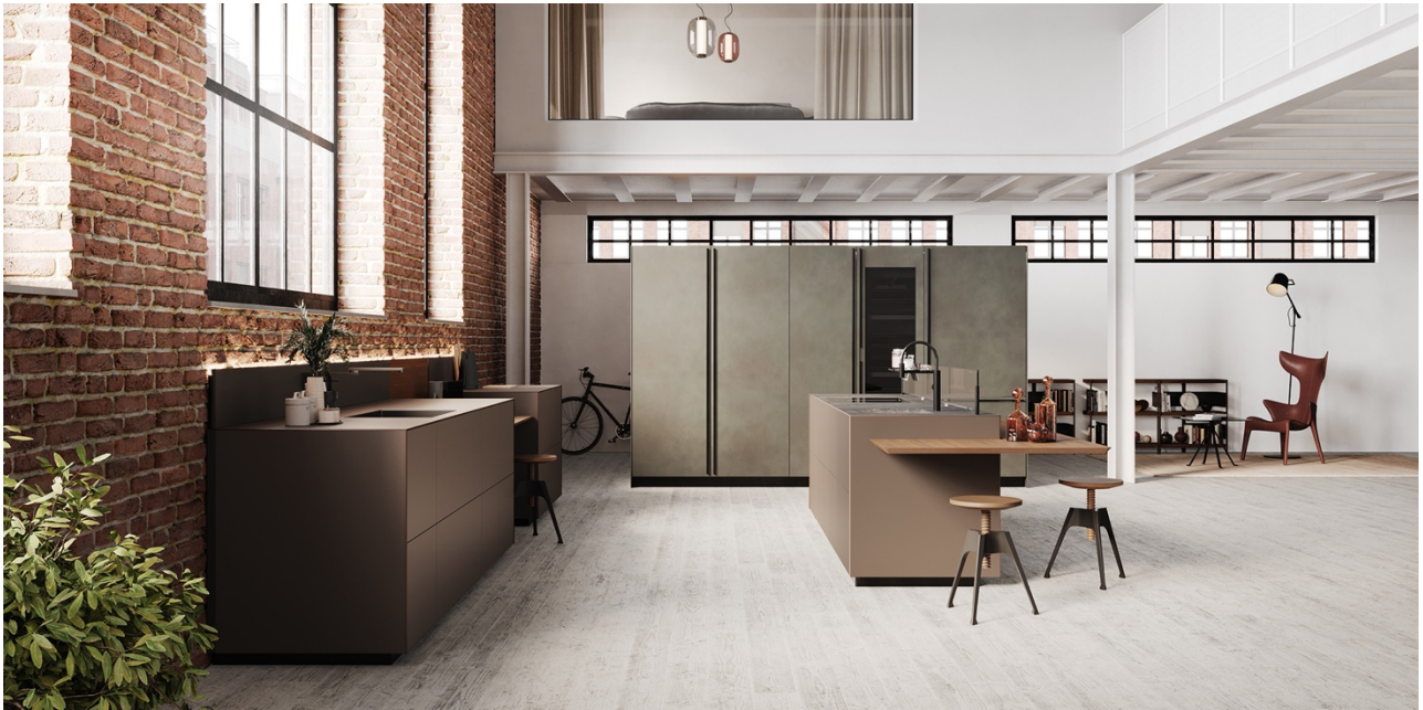
Artematica Soft Outline

For more than forty years now, Valcucine has been looking for a responsible development model capable of giving rise to the creation of projects, intuitions and solutions which - with a view to ongoing improvement while respecting man and the environment- have revolutionised kitchen conventions, to the extent of becoming truly groundbreaking. Inside the Valcucine showroom in C.so Garibaldi 99 in the Brera district of Milan, during the Fuorisalone 2023 event the company will be presenting its new kitchen layouts – its characteristic “Special Elements” – which have become the distinctive trait and symbol of ongoing innovation with their “magical doors”, paired with new materials and wooden finishes designed to lend a warm feel to the typical, hi-tech design.