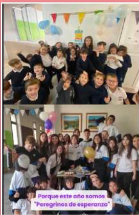
Cabrini mission anniversary in Rosario.