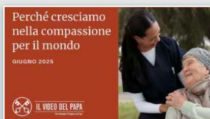
The cover of the June Pope's Video.