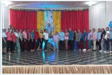
Sacred Heart Feast at Escuela Sagrada Familia No. 1 in Nicaragua.

sisters joined the congregations gathered in the churches near their communities, filling them with warmth and the spirit of devotion. In Russia, a Mass was celebrated about three weeks after the installation of the new painting dedicated to the Sacred Heart at the Cathedral of Novosibirsk, and a Eucharistic Adoration for this very occasion. In Nicaragua, at the Sagrada Familia School No. 1, a celebration was held for the Sacred Heart and for the Festival of teachers. On June 30, all