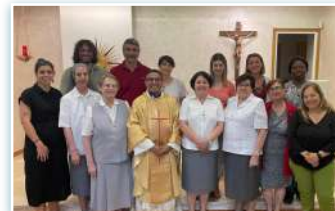
Sacred Heart feast celebrations at the Curia.