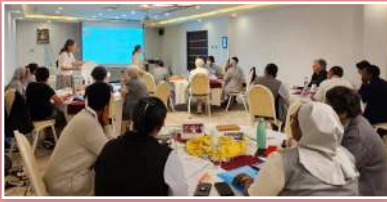
A photo of the Sisters' formation meetings.