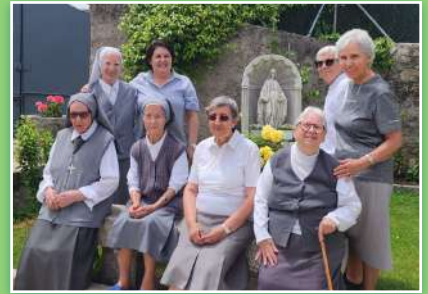
Photo with the community of Los Molinos in Spain.

For the Madrid school, this year is really special: they celebrated the 125th anniversary of the Cabrinian educational mission in Madrid. Many wishes were received from all parts of the Institute!