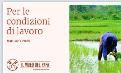
The cover of the Pope's May Video.

We retrace the words of three Popes: Francis who recalls Joseph, the carpenter, and defines work as "an anointing of dignity", Benedict XVI who underlines its fundamental importance for man and for society and John Paul II who invites us to heal economic and social imbalances and situations of injustice. We pray that through work every person will be fulfilled, families may maintain their dignity and society may become more human.