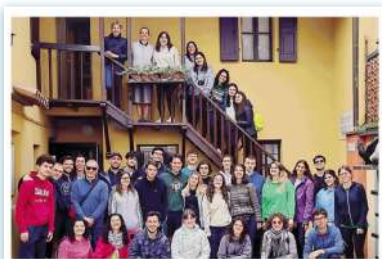
Youth pilgrimage to Sant'Angelo Lodigiano.