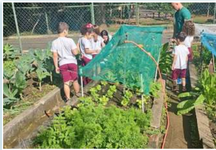
Environment Day in Brazil.

✱ On May 22, the students of the first year of the Madre Cabrini School in Rosario participated in a day of reflection, games, and prayer at the Schoenstatt Shrine.