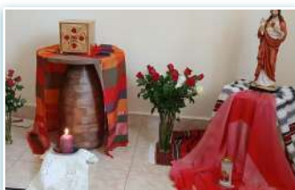
Celebration in the chapel of the International Novitiate in Kenya.

enriching experience. Each mission of the Region participated with enthusiasm, joining millions of people around the world who celebrate this Sacred Anniversary. At the heart of every celebration was Holy Mass. Our