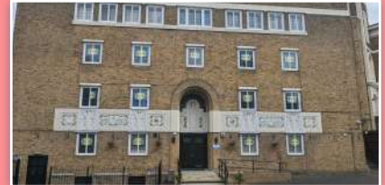
Cabrini Campus in Honor Oak, London.

After the school closure, we are happy to announce that the mission in London is taking on a new form. Cabrini Community Campus is its new name. The building will house a new nursery, the Apostolate of Catholic Mothers, the communities of the Neocatechumenal Way, four artisans who are all linked in various ways to the Catholic Church, the Catechists of the Good Shepherd and probably the Catholic Truth Society. From September, the structure will also host the daily weekday Holy Mass.