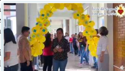
Day of preparation for the Feast of the Sacred Heart in Guatemala.