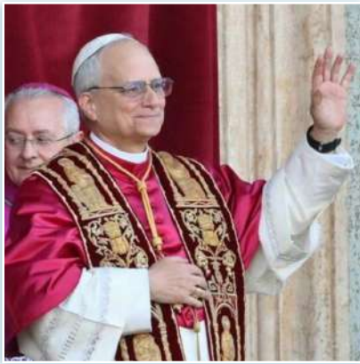
Pope Leo XIV on the day of his election.

Our world is increasingly ravaged by wars, injustice and inequality. We MSCs join in the renewed calls of Pope Leo XIV to find ways for peace and for the defense of war-torn peoples!