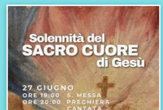
Poster of the UISG celebration at the Church of the Gesù in Rome.