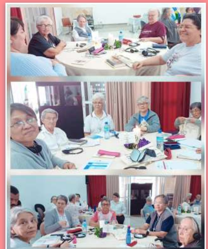
St. Francisca Cabrini Provincial Assembly.

On May 15, the Cabrinian mission in Rosario, Argentina turned 124 years old. The school started its journey with elementary school and then grew with the addition of other levels of education. Our celebration was full of great pride and shared joy as we always try to make everyone feel the great love of the Sacred Heart and the protection of Frances Cabrini!