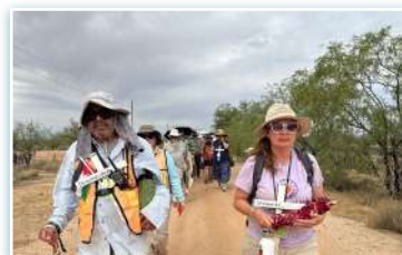
22nd Migrant Trail Walk.