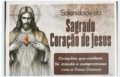
Celebrations in preparation for the feast at Collegio boni Consilii.