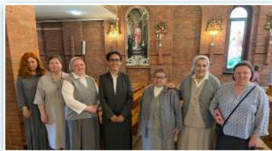
Group photo in Novosibirsk Cathedral where the painting was installed.

June 1 was a very special day for the mission in Russia!