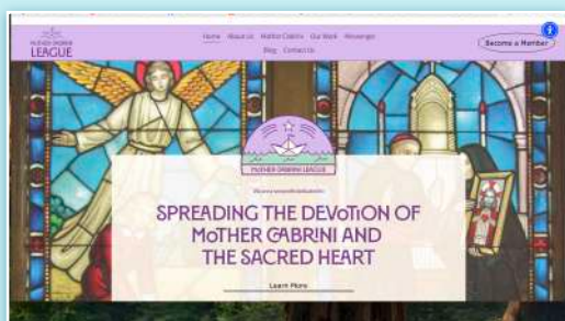
Screenshot of the Cabrini League website.

Like the previous one, it is in four languages (Italian, English, Spanish and Portuguese) and will still be accessible at the link or at www.cabriniworld.org .