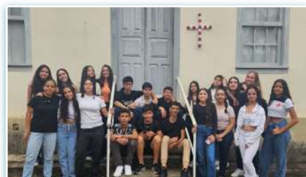
Regina Coeli College boys for the 1st Cabrinian Youth Meeting.