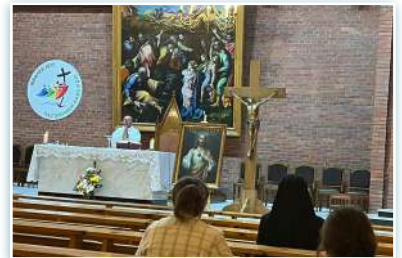
Celebration on the occasion of the Feast of the Sacred Heart in Novosibirsk.