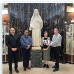
Visit of the three Brazilian priests to the Shrine in New York.