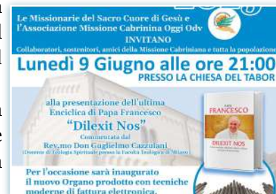
Event poster at Tabor Church.

✱ On June 25, a day of reflection on global health was held at the Cabrini Dispensary in Guatemala, also in preparation for the Feast of the Sacred Heart.