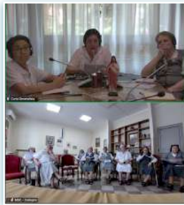
Zoom call for the Feast of the Sacred Heart.