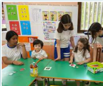
Activities at the Cabrini College in Madrid.

On June 27, the Solemnity of the Sacred Heart of Jesus, was a great joy throughout the Institute. In all the apostolates, this Feast was celebrated with much faith, joy and creativity. In the Generalate in Rome, the General Council and its employees celebrated a Mass of thanksgiving and shared lunch together.