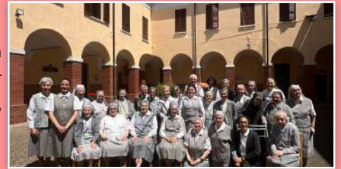
Group photo at the Mater Gratiae Provincial Assembly.