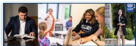
New service for migrants and refugees at Villanova University.

✱ In mid-June, Villanova University announced the opening of the Mother Cabrini Institute on Immigration. Congratulations to the university for this service to protect migrants and refugees and a special thank you for dedicating it to Mother Cabrini. The Mother Cabrini Institute on Immigration at Villanova University involves university and community partners in teaching, research, advocacy, and service for migrants and refugees.