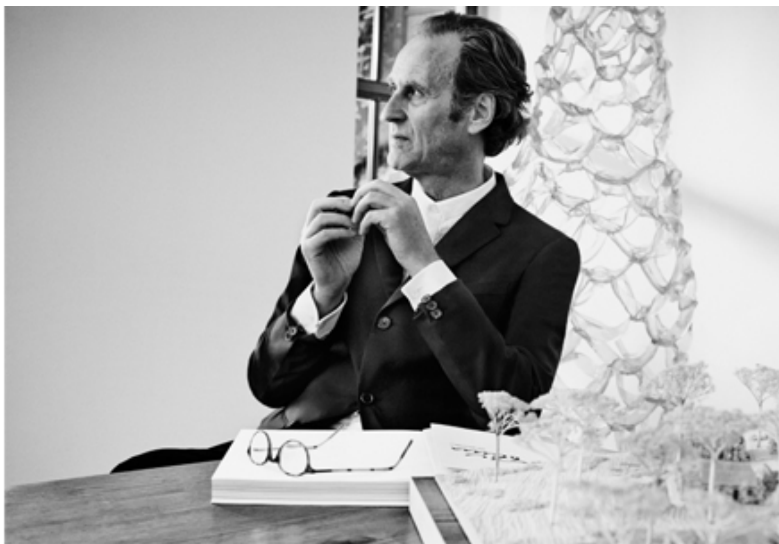
Suit By Jil Sander | Shirt By Burberry Prorsum