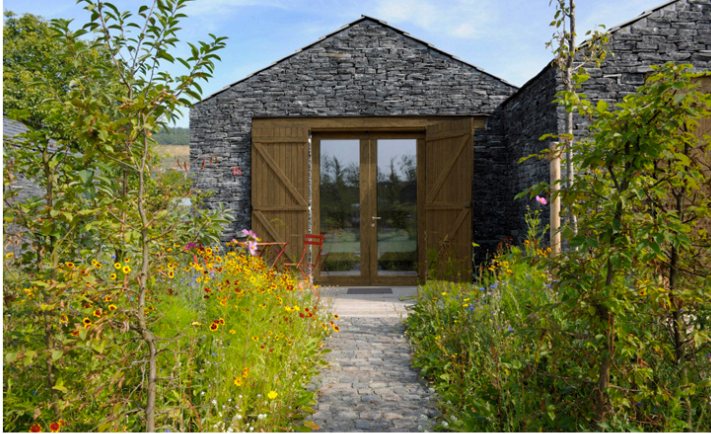
Each lodge features a small wooden terrace and private garden. Prices start from €70 per night 07 of 08 Prev / Next Start Slideshow