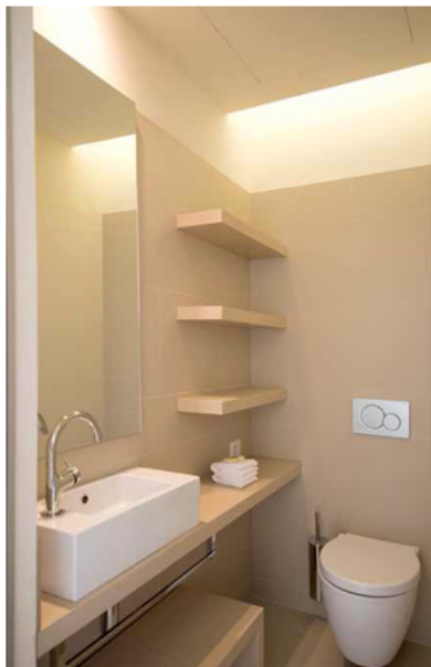
A camping house rental starts from €67.30 per night