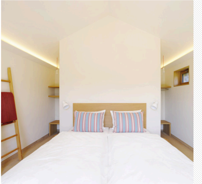
Like at the camping site, the lodges are compact and frill-free, with the opulence coming only from the natural setting. The interiors are clean, harmonious and, best of all, affordable