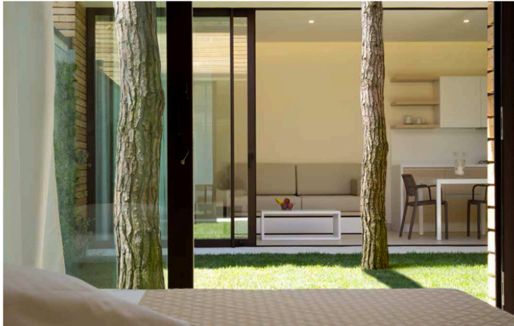
By building the patio houses within and around the trees, guests enjoy natural shade and a private outdoor experience while sleeping in the comfort of a two-bedroom, one-bath home