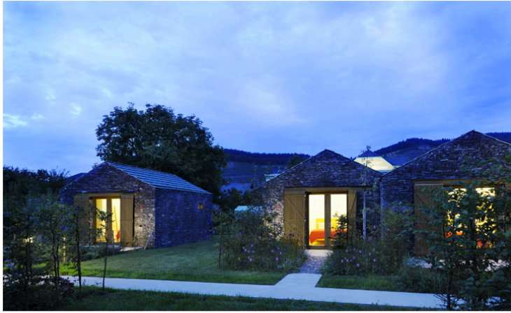
Preserving the natural surroundings was also essential at the Wine Heritage Longen Schöder, where Thun designed twenty 20-square meter houses built from local stone within an existing orchard of apple, walnut, lime and chestnut trees 06 of 08 Prev / Next Start Slideshow