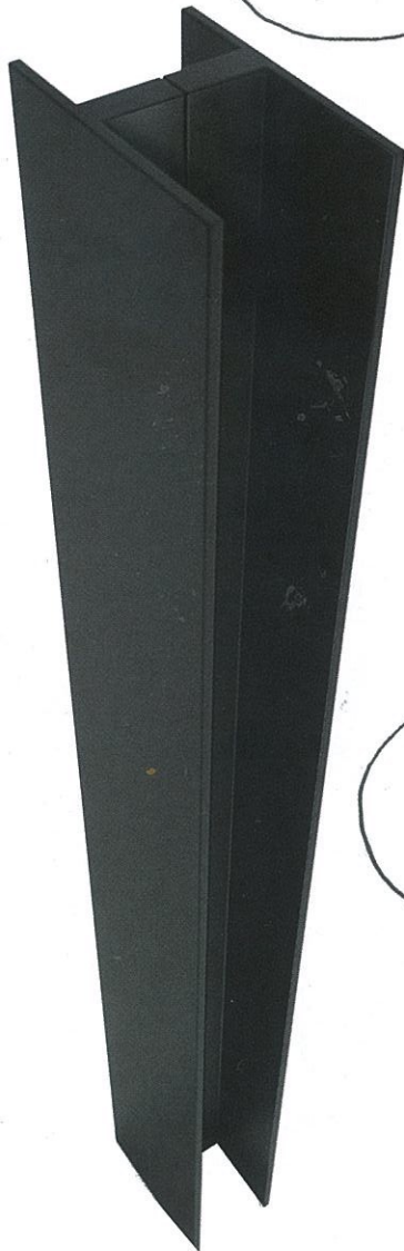
IMAGE AND DESIGN SKETCHES OF THE T TOWER, THE FREESTANDING RADIATOR DESIGNED BY MATTEO THUN & ANTONIO RODRIGUEZ FOR ANTRAX IT . MADE WITH A SINGLE ALUMINIUM SECTION, T TOWER IS AVAILABLE WITH A TOWEL RACK HANDLE THAT WRAPS THE VOLUME.

Minimal, sculptural, monolithic, almost Kubrick. T Tower, the new radiator from Antrax IT, represents a freestanding evolution of the iconic Serie T model. Like its predecessor, it bears the signature of Matteo Thun & Antonio Rodriguez. Defined by a single aluminium section that permits creation of multiple configurations, T Tower gets away from the usual position against the wall, becoming an eclectic, versatile decor feature: developed for the living area, it can take on the ideal features for the bath environment thanks to an optional towel rack with a squared form surrounding the volume. T Tower (measuring 170x14x22 cm) operates with electricity (this version has a round base in brushed stainless steel) or with water. To boost its decorative impact, it comes in over 200 different colors. ■ A.P.