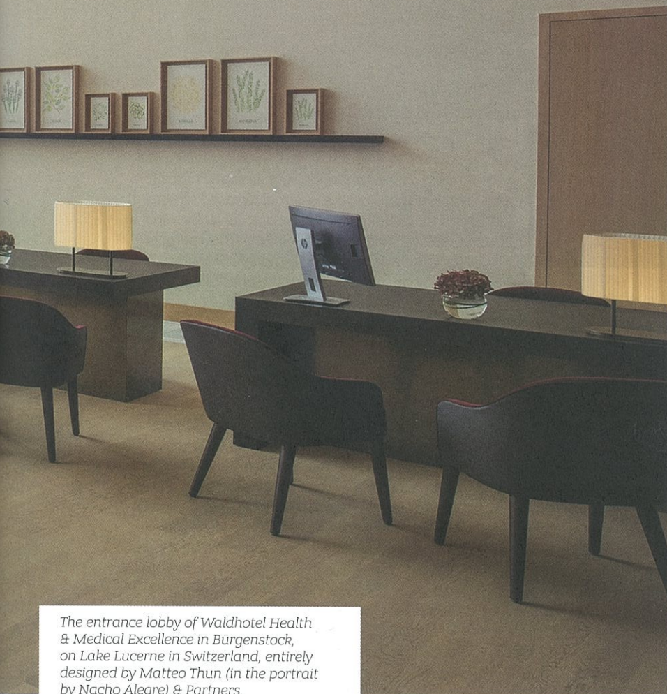
The entrance lobby of Waldhotel Health & Medical Excellence in Bürgenstock, on Lake Lucerne in Switzerland, entirely designed by Matteo Thun (in the portrait by Nacho Alegre) & Partners.