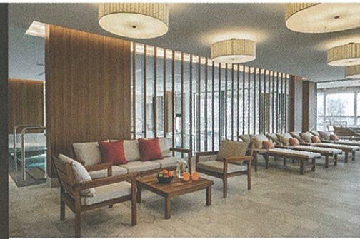
Views of interior spaces of the Waldhotel. The library, a standard rehab room, the spa-swimming pool. Furnishings by Matteo Thun Atelier.

The linguistic expression is always a process of subtraction that 'creates no waste' and acknowledges the importance of fitting buildings into their context, with low ecological impact. The environmental sustainability of a project, in fact, does not have to do only with energy efficiency, but also with aesthetic values."