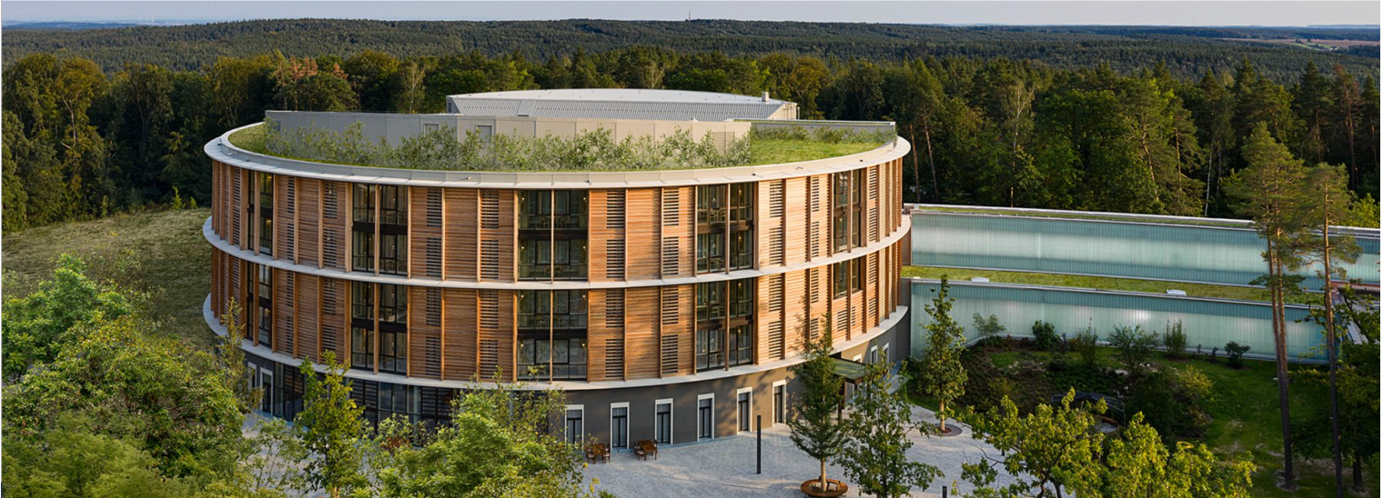
matteo thun adds hospitality aesthetics to waldkliniken healthcare facility in germany

matteo thun & partners has completed the waldkliniken eisenberg , the largest orthopaedic center in germany. with the idea of making the patient feel more like a guest, the aim of the design of the healthcare facility and its interiors is to positively influence the relationship between the physical space and the human well-being. hospitalexpert HDR GmbH supported matteo thun and his team in planning and implementing efficiency, functionality and user-friendliness of the new building.