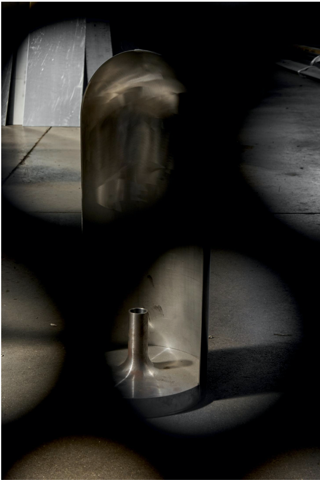
'Edicola' candleholder by Luca Nichetto, work in progress