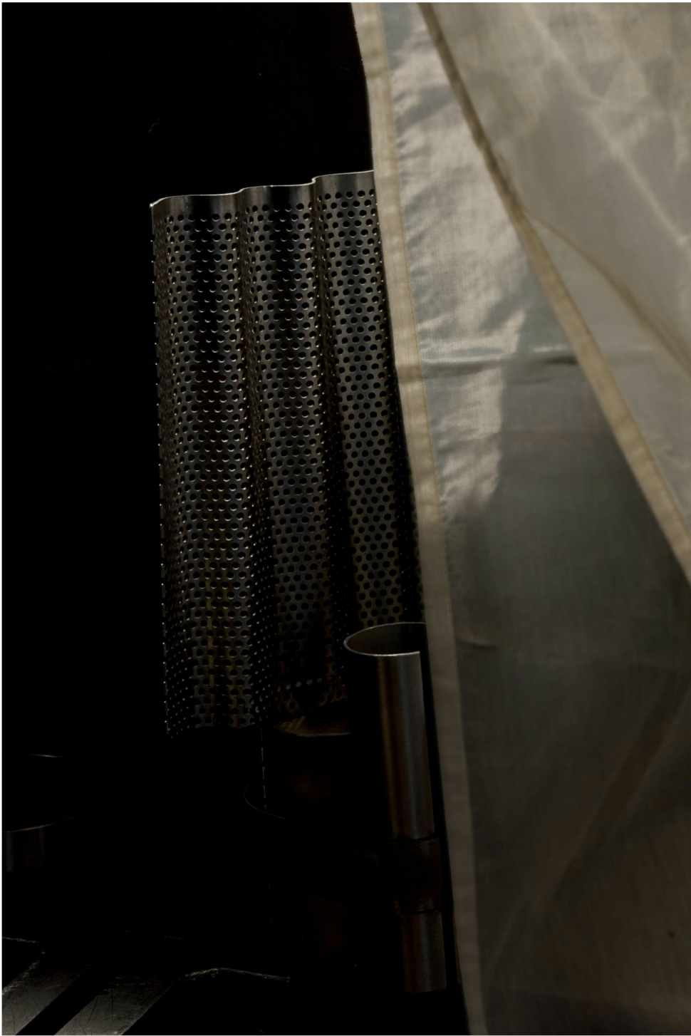
'Hope' candleholder by Patricia Urquiola, work in progress