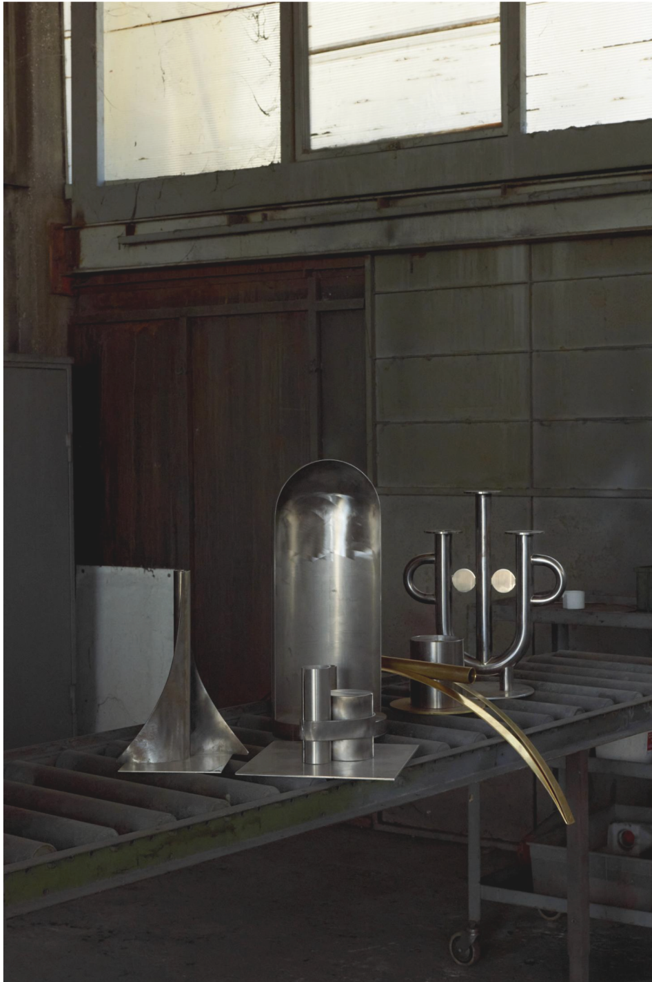
Work-in-progress candleholders in the Mingardo workshop, from left, 'Incontro' by Alberto and Francesco Meda; 'Edicola' by Luca Nichetto; 'Hope' by Patricia Urquiola ; 'Rue' by Federica Biasi; 'Sant'Agata' by Matteo Thun; and 'Instrument N 01' by Jaime Hayon