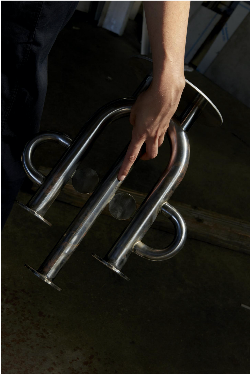
'Instrument N OI' candleholder by Jaime Hayon, work in progress