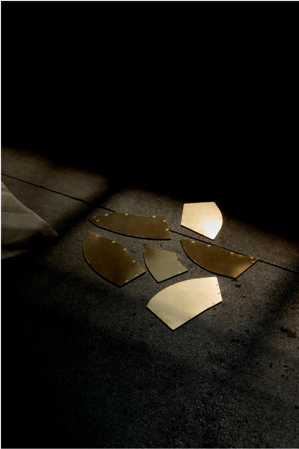
Work in progress for Michele De Lucchi's 'Riflesso' candleholder