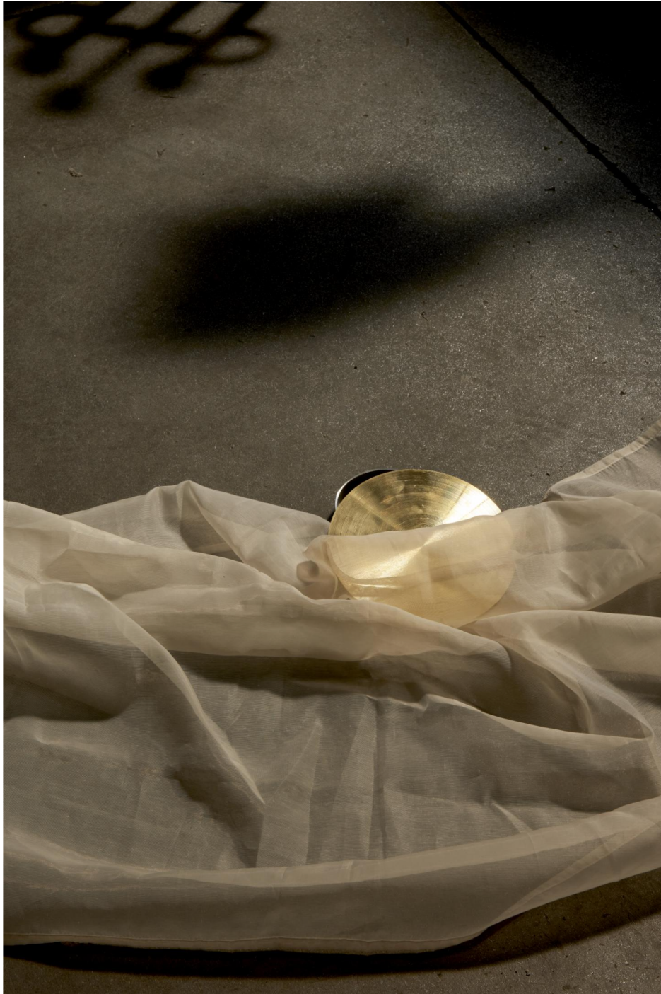
Work in progress for 'Sant'Agata' candleholder by Matteo Thun

The candleholder's flame is considered to bring light in places of darkness, and has connotations of positivity. Each of the ten designers was invited to create their own interpretation of these themes. The collection will be a medley of styles and ideas that are unified by a shared objective.