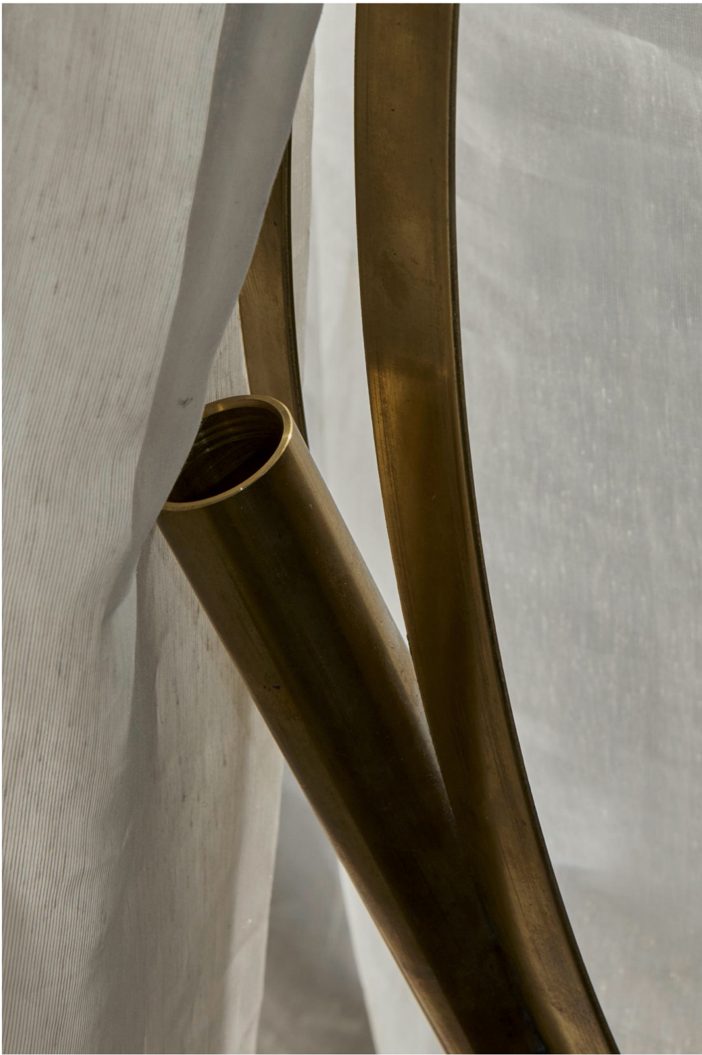
'Rue' candleholder by Federica Biasi, work in progress