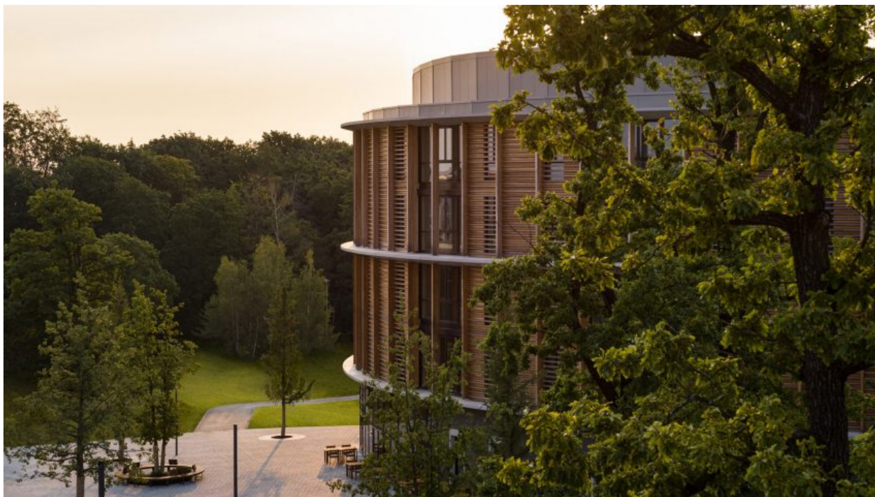
Waldkliniken Eisenberg is surrounded by the Thuringian Forest

Matteo Thun & Partners was awarded the contract, together with HDR Germany, because of its extensive experience working in the hospitality sector, which enabled it to propose a design that combines the comfort of a hotel with the performance criteria required by a care facility.