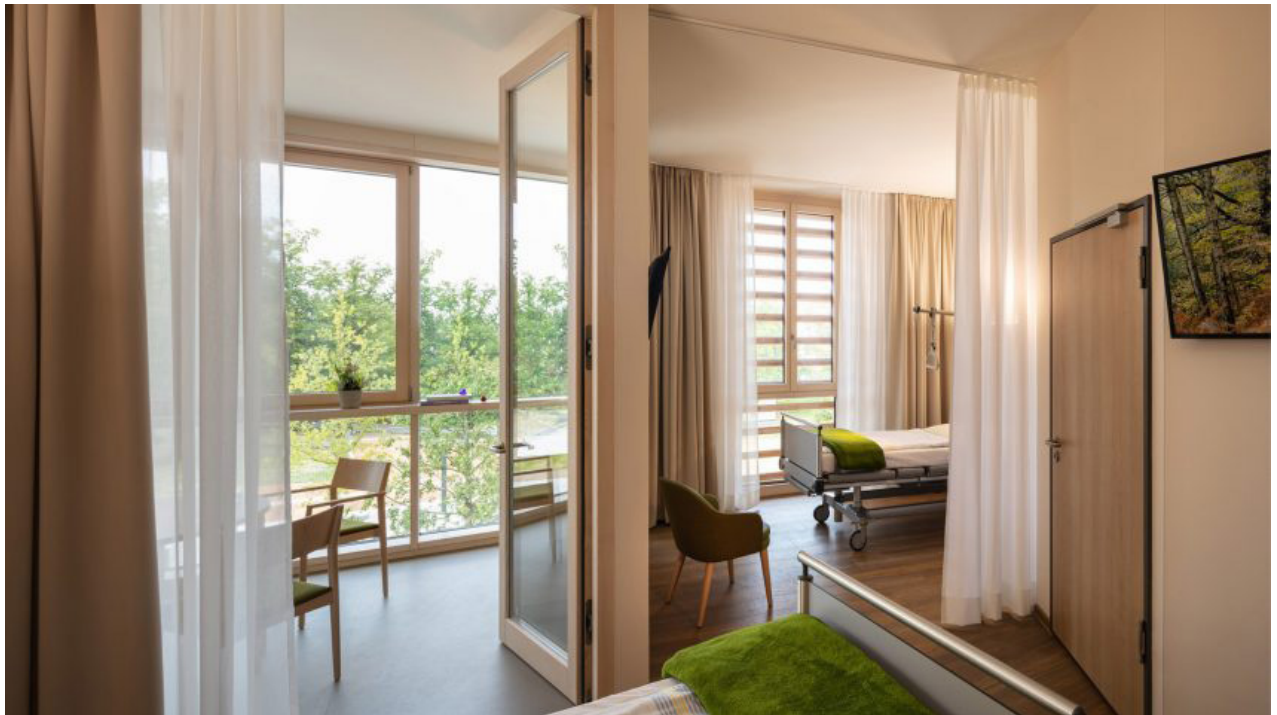
The patient rooms have a neutral palette

A cafeteria for patients at the centre of the building connects to a planted courtyard, while a staff canteen opens onto the surrounding landscaped grounds.