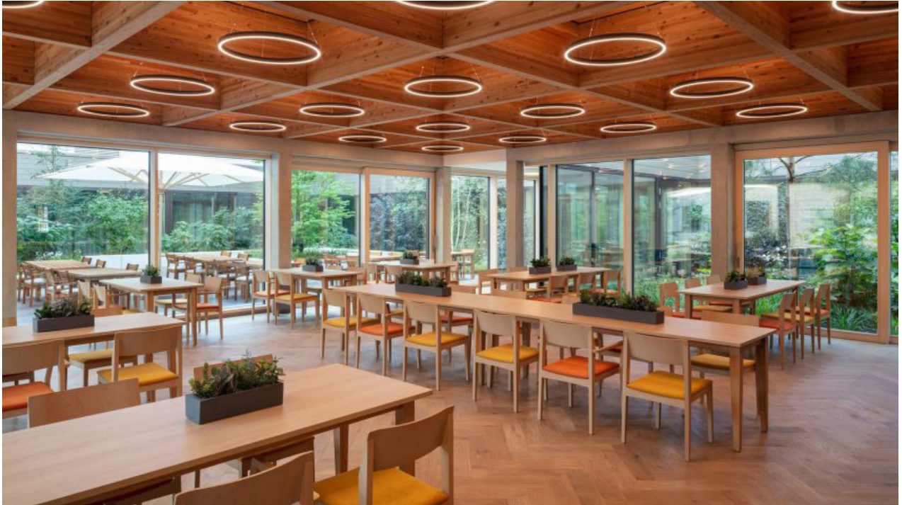
The interior of the hospital was designed to resemble a hotel

"The arrangement of bathrooms, furniture and veranda offer the possibility of both interaction and privacy as needed. In addition, patients can eat together and talk to each other in the light-flooded piazza."