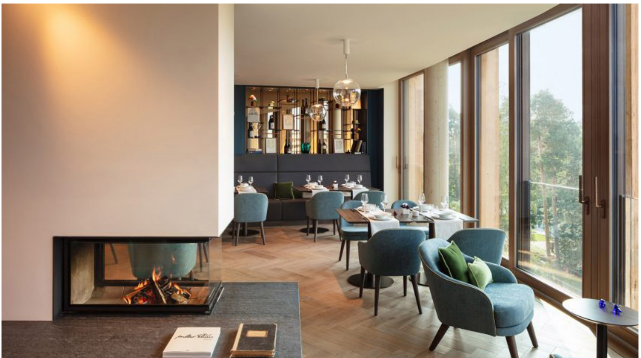
Amenities in the building include a fine-dining restaurant for patients and guests

Wood is used throughout the project to create a warm and calming feel inside the building. Green roofs and planted courtyards enhance the connection with the surrounding nature.