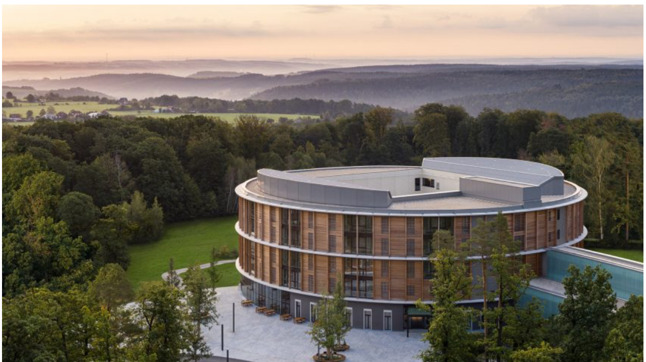
Waldkliniken Eisenberg is a hospital facility in Germany designed by Matteo Thun & Partners and HDR Germany

In 2013, Matteo Thun & Partners won an international competition to design a new hospital wing for Germany's largest orthopaedics centre, the Waldkliniken Eisenberg. The studio collaborated with HDR Germany on the project.