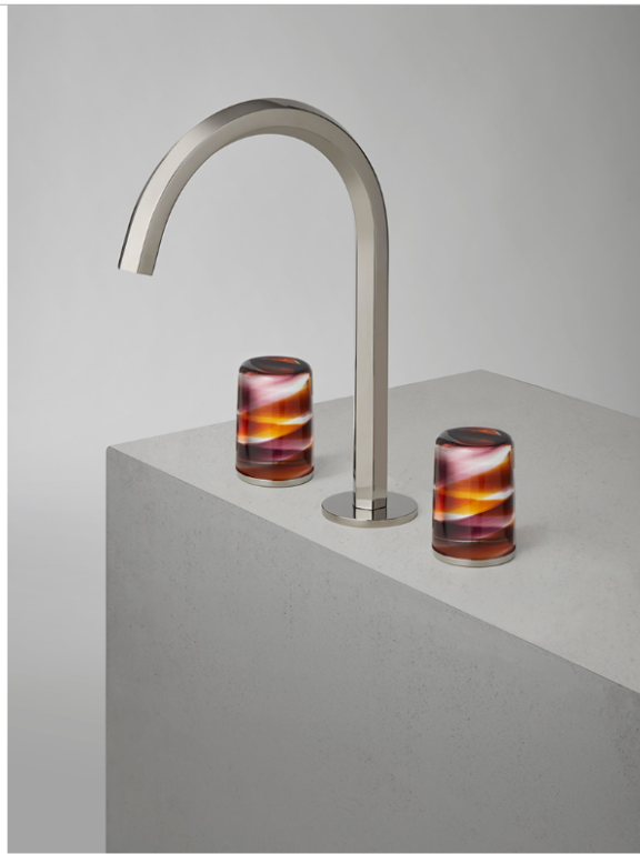
The two-tone Venezia handles in amethyst and amber.

The two-tone handles feature hypnotic swirls of pigment and come in a trio of colorways amplified by their cylindrical form: aquamarine and green; amethyst and amber; and red and amber. The egg-shaped filigree handles, which utilize a 16th century method of inserting glass rods into other glass forms to create a sinuous effect, come in white and black. The faceted-glass handles, meanwhile, come in sky blue, amber, or white and can be either transparent or opaque; they also feature a metal base that is flush with the glass body.