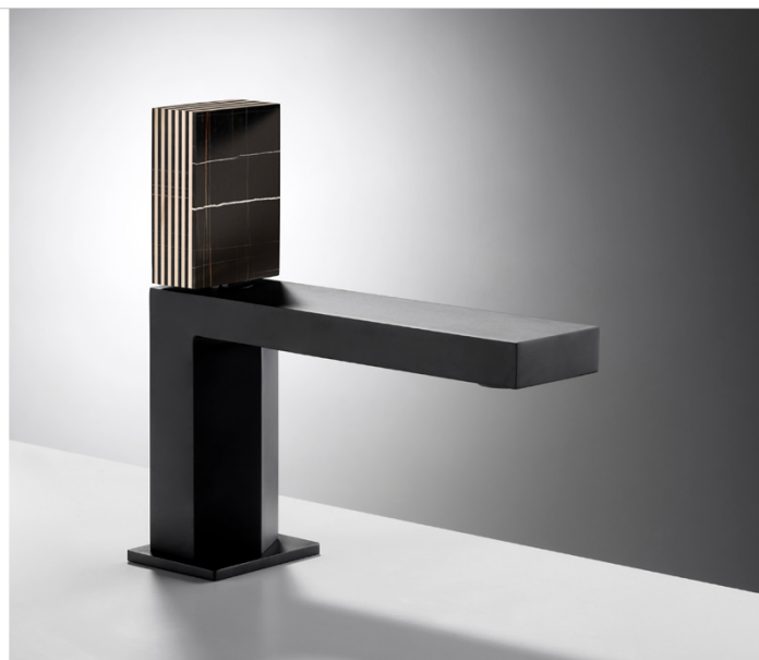
Venezia series, single lever mixer tap.

Marble also figures into the duo's contributions to the Venezia series, with white-and-black marble handles and a single-lever mixer tap—both of which can add the perfect finishing touch to any architectural bath setup.