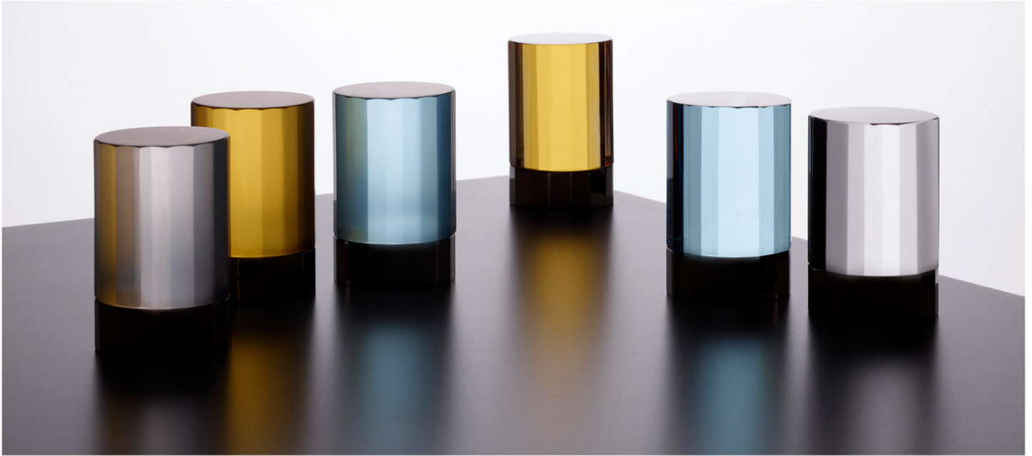
Venezia series, handles in cut, multi-faceted glass.