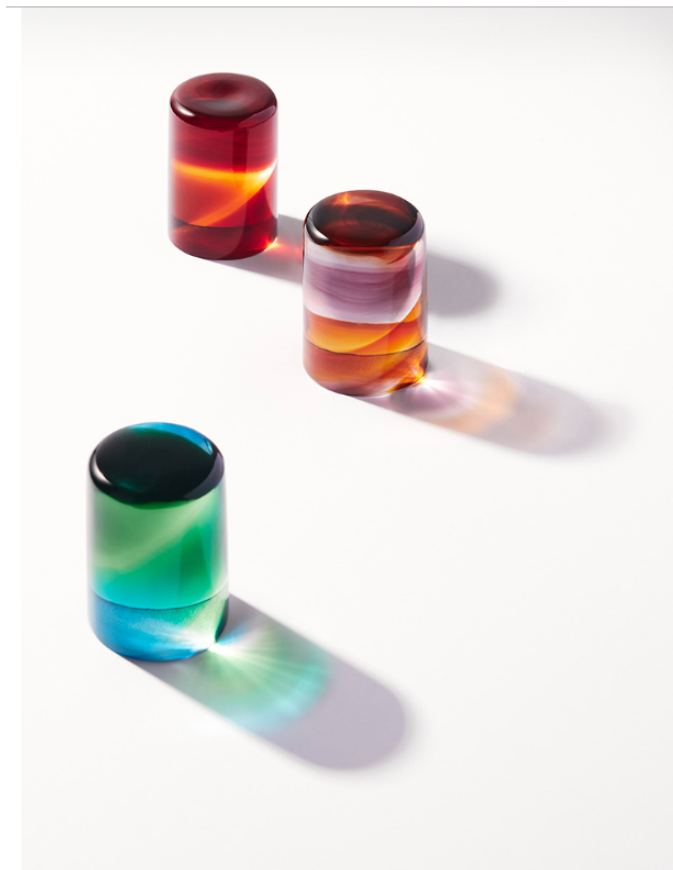
The two-tone Venezia handles have a cylindrical shape with rounded edges that amplify the fluid effect of the two-tone combinations: aquamarine/green, amethyst/amber, red/amber.

For the collaboration, Thun and Rodriguez have added to Fantini's Venezia series, designing a series of gemlike handles that add style and sophistication when paired with any faucet. The new pieces include two-tone handles, as well as filigree and faceted-glass styles, and sculptural marble knobs.