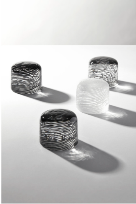
The egg-shaped filigree handles, which come in white and black, are soft and sensuous to the touch.