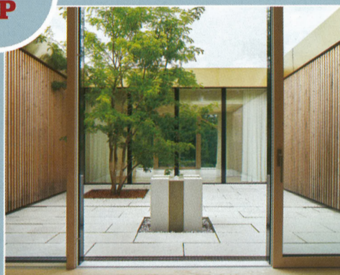
INNER GARDEN donate relaxing spaces for guests.