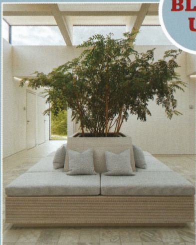
WOOD paneling in the interior creates a warm atmosphere.