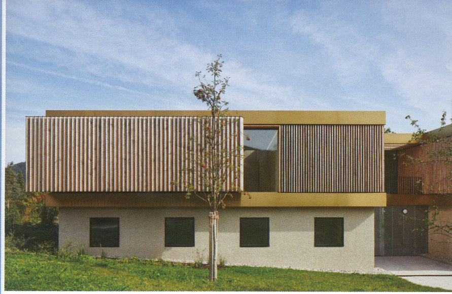
HERE: Crop of architecture structure - wooden facade - material mix. Under, top view, 4 equal atrium with treatment rooms and Piazza. BELOW: Front view with main entrance.