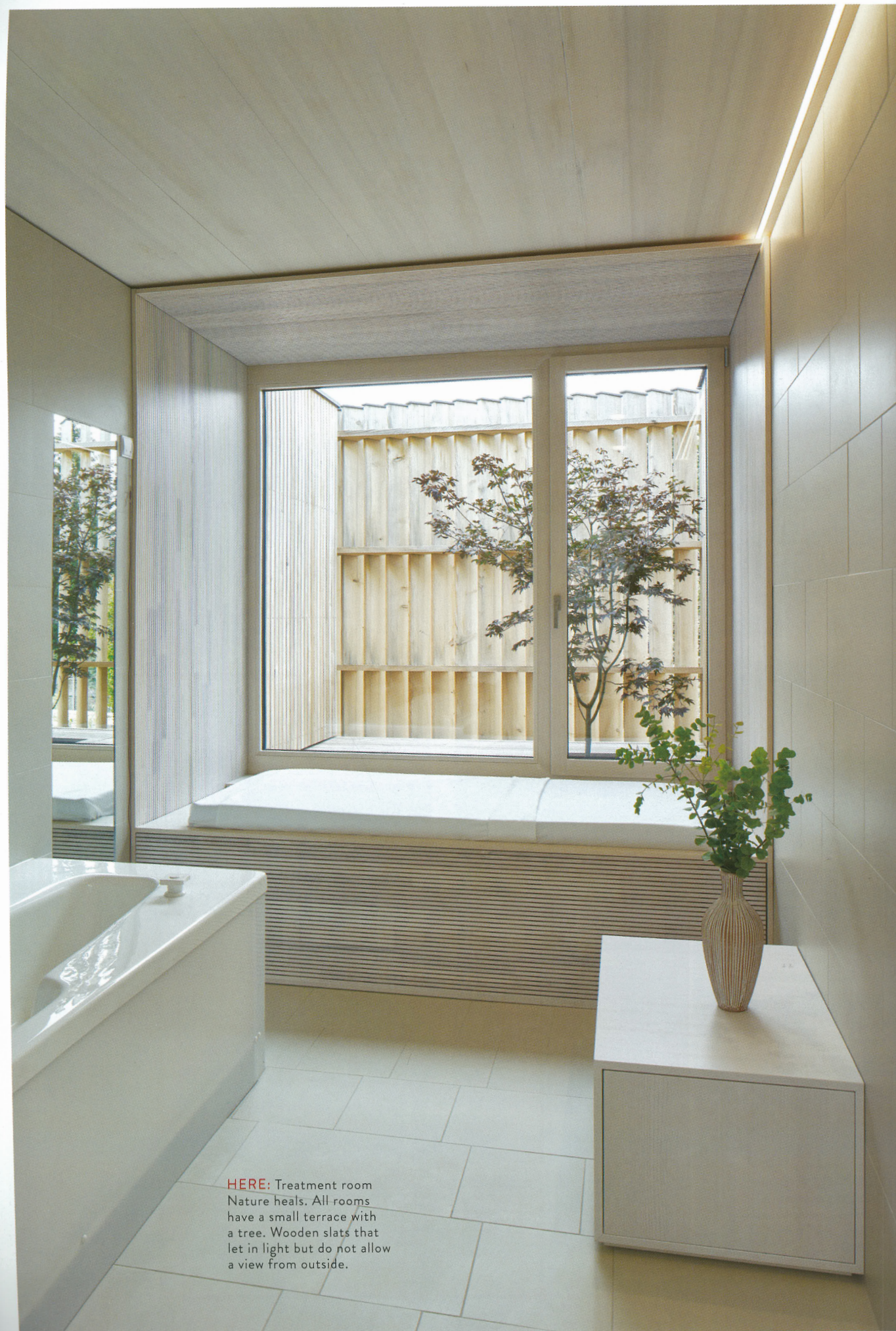
HERE: Treatment room Nature heals. All rooms have a small terrace with a tree. Wooden slats that let in light but do not allow a view from outside.