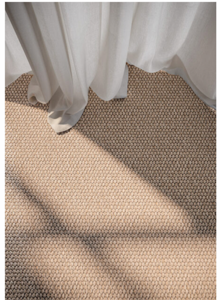
"Rodi Talco"