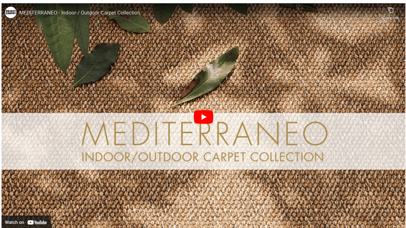
Mediterraneo Indoor-/ Outdoor Carpet Collection Video: Object Carpet