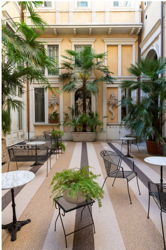
Launch event in Milan