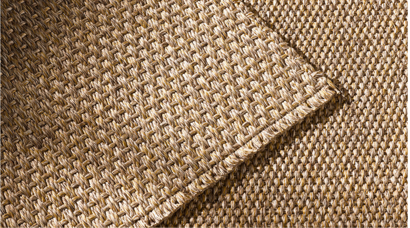
"Capri Rodi" Photo: Object Carpet