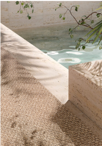
"Menorca Talco"

For their joint project the creative team took its inspiration from nature, as Rodriguez explains: "What inspired us was being able to come up with the kind of feel, materiality and nuanced shades, the like of which has never been available before in recycled carpets. Made of waste plastic and entirely recyclable, "Mediterraneo" stands at once for lightness and effortlessness. It conveys the feel of a Mediterranean heritage – which also explains its name." The waste plastic is processed in a multistage procedure in which the collected, sorted and cleaned waste material is transformed into polyester chips. These are subsequently processed into filament fibers, from which the carpeting is then made. In the latter case, considerably less carbon is released than with carpets made from new polyester. As Rodriguez explains, this has allowed the company to bring traditional values and craftsmanship up into the 21st-century industrial age: "With 'Mediterraneo' it was our aim to reinterpret the ancient tradition of the Mediterranean weaving mills and to pursue a more ecologically sound approach in the process. This tradition, which started with the ancient Egyptians and is still to be found nowadays all along the Mediterranean coastline, uses natural fibers. With the expertise of Object Carpet and the common desire for innovation and a 'woke' approach we have replaced these fibers with the kind that consist mainly of waste plastic dredged from the Mediterranean."