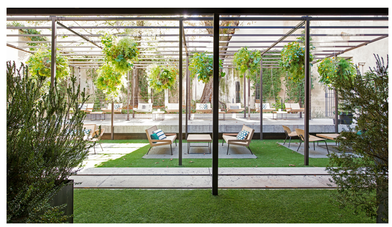
Elle Decor Design Therapy, Déjeneur sur l'herbe - Restaurant