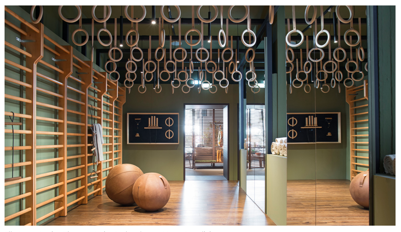
Elle Decor Design Therapy, Active Body - Gym

No experience without scents. A wooden walkway leads over a pond and brings in nature and its flavour.