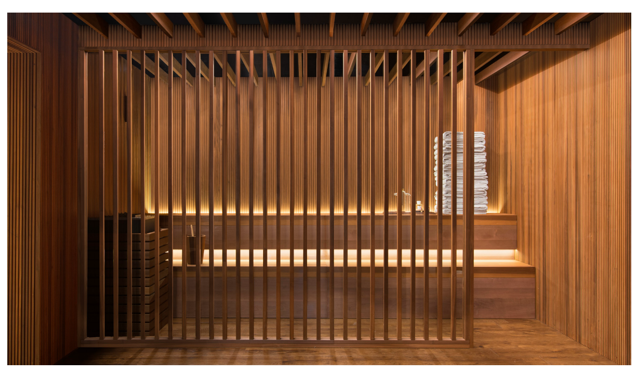
Elle Decor Design Therapy, Sauna - Body Care

A corridor leads to the area devoted to curative body care, focused on wellbeing, balance and activity. It's just about ease. Soft and reflective glass, porcelain stoneware with marble effect for the Hamam – its the interior is filled with purifying sunlight. The sauna with large sliding wooden doors ensures privacy, calmness and openness at once.